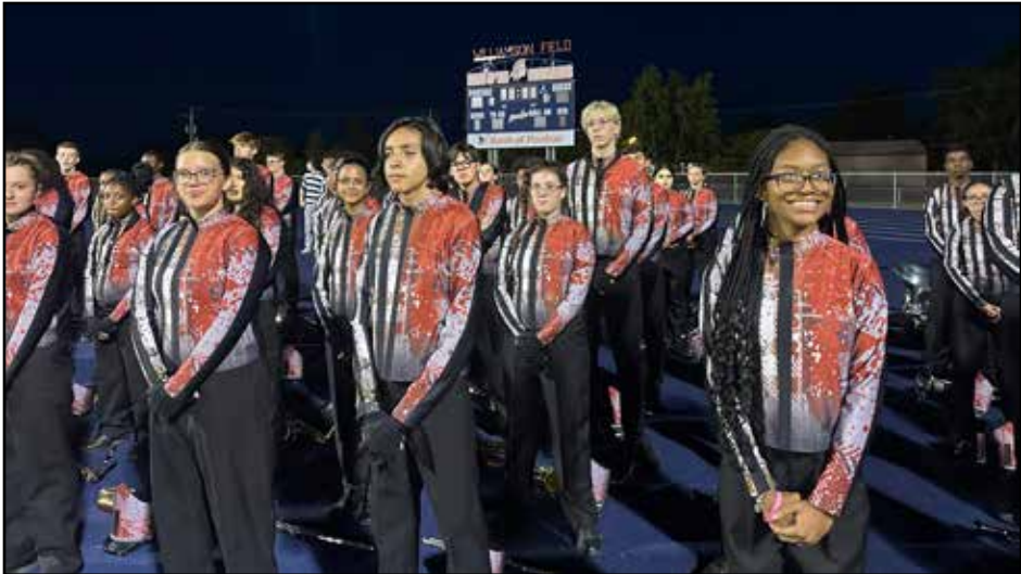
The Marching Astros wait patiently during the awards ceremony at Pontiac High School. They would learn the Shepard band won Grand Champion as the top band among all classes.