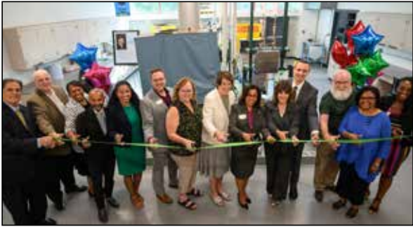
Members of Moraine Valley's Board of Trustees join members of the Executive Leadership team, faculty and staff in cutting the ribbon on an updated Nondestructive Testing lab.

“Access to state-of-the-art equipment will enhance our reputation as the only community college in Illi-