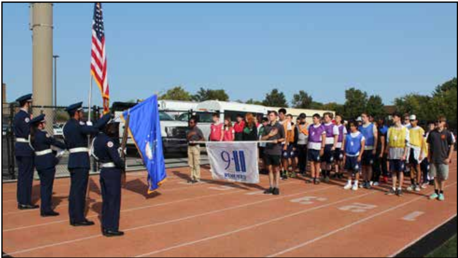
After posting colors during the National Anthem, the colorguard detail from in the U.S. Air Force JROTC program at Shepard High School exits. Students enrolled in JROTC then walked 14 miles on the stadium track while classmates read the names of all victims of the September 11, 2001 terrorist attacks.

The event starts with the posting of colors, the national anthem, an introductory speech by Johnson, and then the solemn walk.