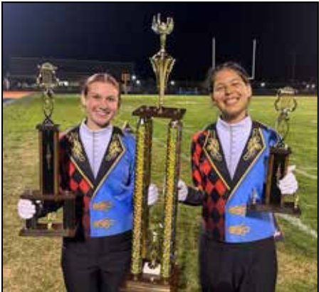
Drum majors proudly display the awards, including Grand Champion, won by the Shepard High School marching band at the competition hosted by Pontiac High School.