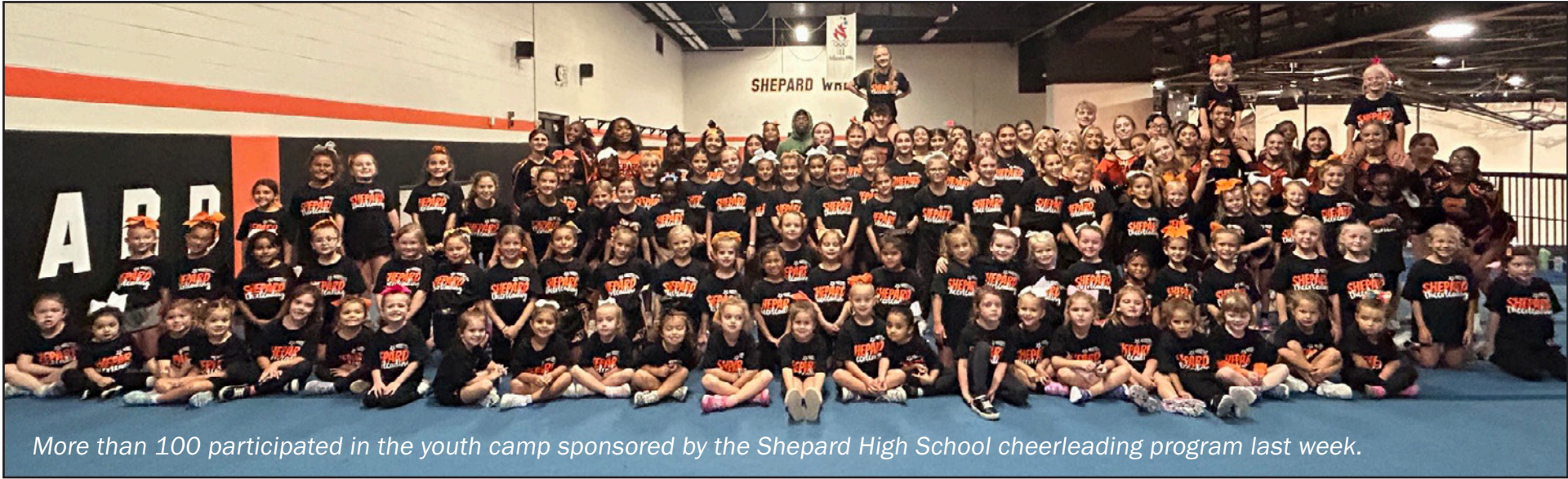
More than 100 participated in the youth camp sponsored by the Shepard High School cheerleading program last week.

Campers learned stunts, tumbling, jumps and chants. Then they performed with the Shepard cheerleaders on Friday night at the football game.