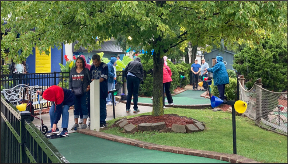
Seniors having a fun time golfing despite the rain.