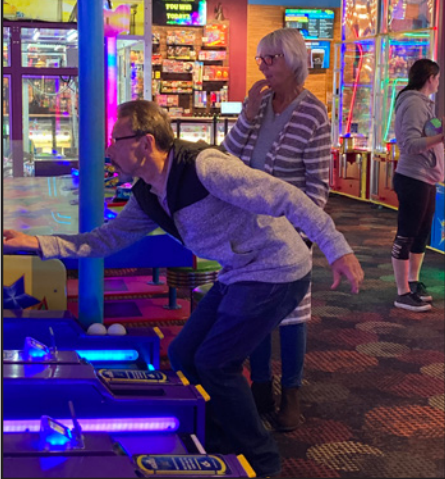
Bowling for prizes